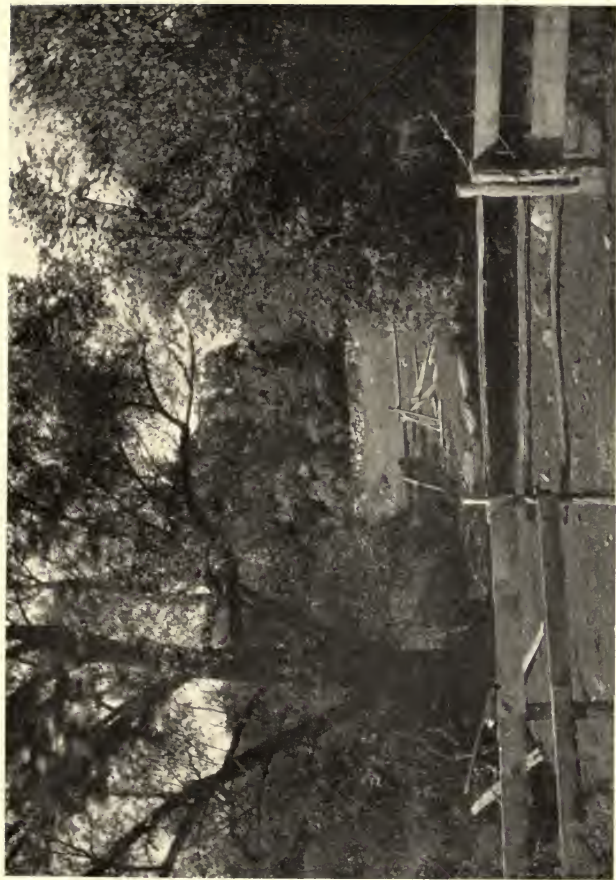
SITE OF THE BLOCK-HOUSE, SCITUATE, MASSACHUSETTS